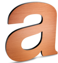
Satinbrite™ Face & Painted Sides