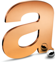
Edgeblend™ (Up to 24")