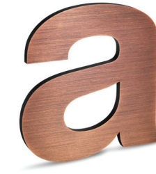
Medium Oxidized Satin Brushed