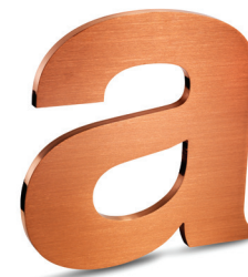
Satinbrite™ Face & Polished Sides