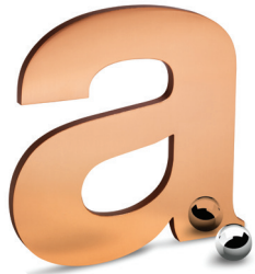
Mirror Polish (Up to 24")

Copper alloy 110 provides a distinguished reddish appearance. Virtually all available finishes offer a warm architectural look in interior applications, while shades of oxidation perform well in both the interior and exterior. All copper solid cut letters have a protective clear coat.