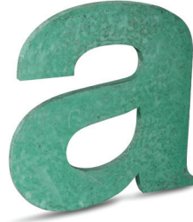
Verde Green Patina